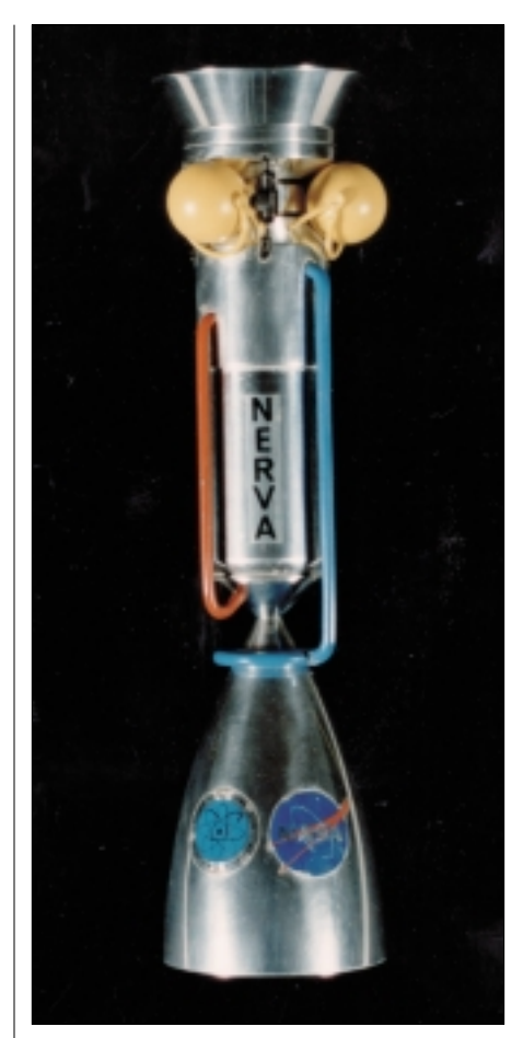
A model of the NERVA engine

the escape velocity—to go out to the moon. Once you hit that 7 miles per second, your engine turns off. Because you don't have enough propellant to keep accelerating. So, basically, at 25 000 miles per hour, you switch off and you start drifting toward the moon. It's like you're in a kayak and you paddle real hard and then you stop and let the current carry you. Well, it carries you for awhile. The earth keeps trying to drag you back, and you just make it barely into where the moon's gravitational field takes over. That's why it takes so many days to go to the moon, because you're essentially just drifting.